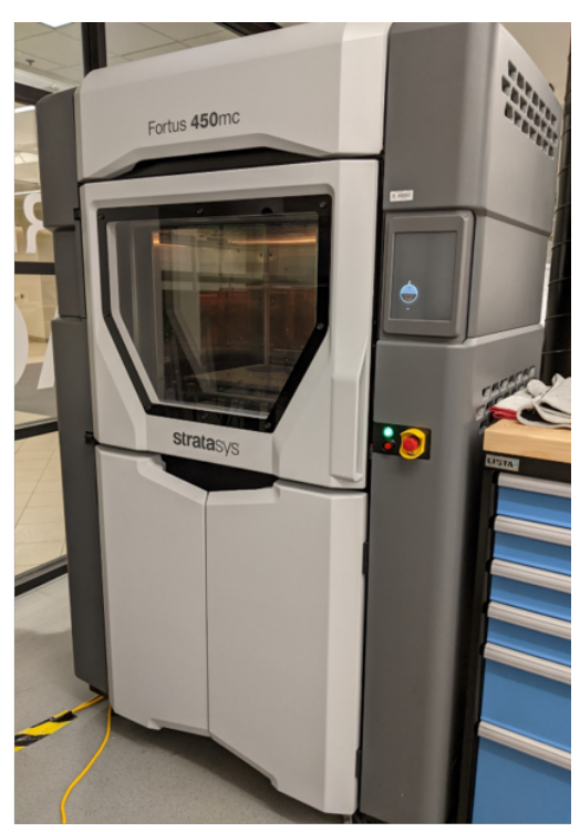
Stratasys Fortus 450mc